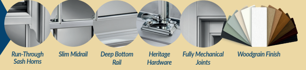
Run-Through Sash Horns

Legacy Premier CHOOSE ALL SIX PREMIER FEATURES ASK FOR DETAILS