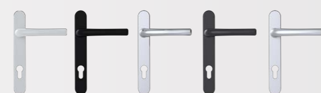
White Black Chrome Anthracite Grey Satin