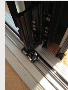
Bottom Roller Hinge