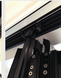
Top Guide Hinge